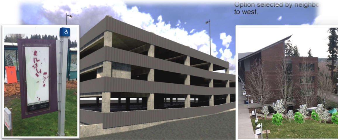
Option selected by neighbors to west.

University of Washington Bothell and Cascadia College